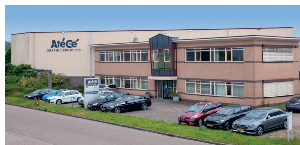
Ink Laboratory & Mixing Centre Alkmaar

In Alkmaar, AtéCé has a modern Ink Innovation Centre with a highly developed laboratory and with state-of-the-art equipment for testing printing inks and product innovations. We also have a professional mixing service for inks. Offset and flexo inks for conventional UV, H-UV and LED UV and food packaging compliant applications are mixed here. In addition, we have a lot of in-house knowledge and we make the difference in the market with our colourists and application specialists. This enables us to supply the right ink for every application, both for offset and flexo printing.