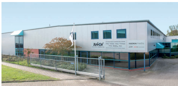
Converting Centre Alkmaar