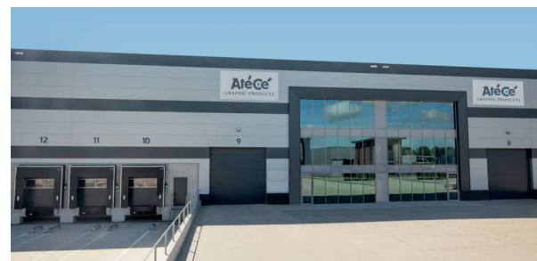
The brand new Distribution Centre Alkmaar