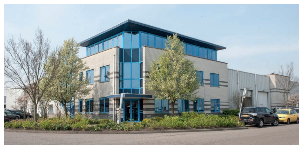
Head Office & Liquid Plant Uitgeest